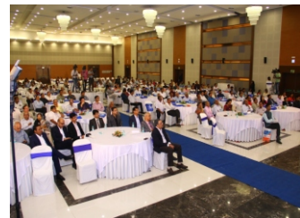
Catching the attention; our Devoted Audience