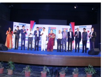
Official launch of "MEHTA FINCON MOBILE APP" by esteemed personalities