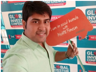
Happy MFGIC Attendee