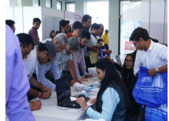
MFGIC - Registration Counter