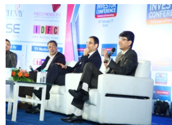
CIO Panel Discussion "Masterminds Insights on Wealth Creation"