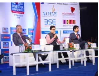
CEO Panel Discussion "Professionalism in Investment"