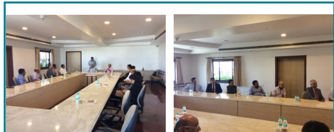
Diamond Factory Visit to Venus Jewel with our invited guests