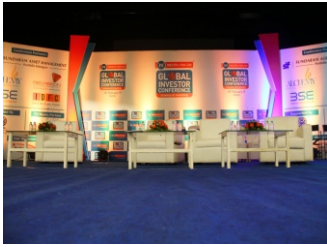
The Stage Ambience