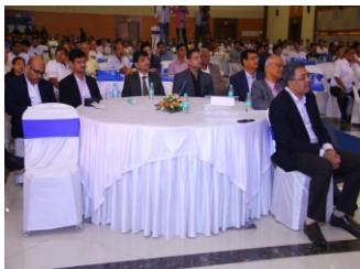
Catching the attention; our Devoted Audience